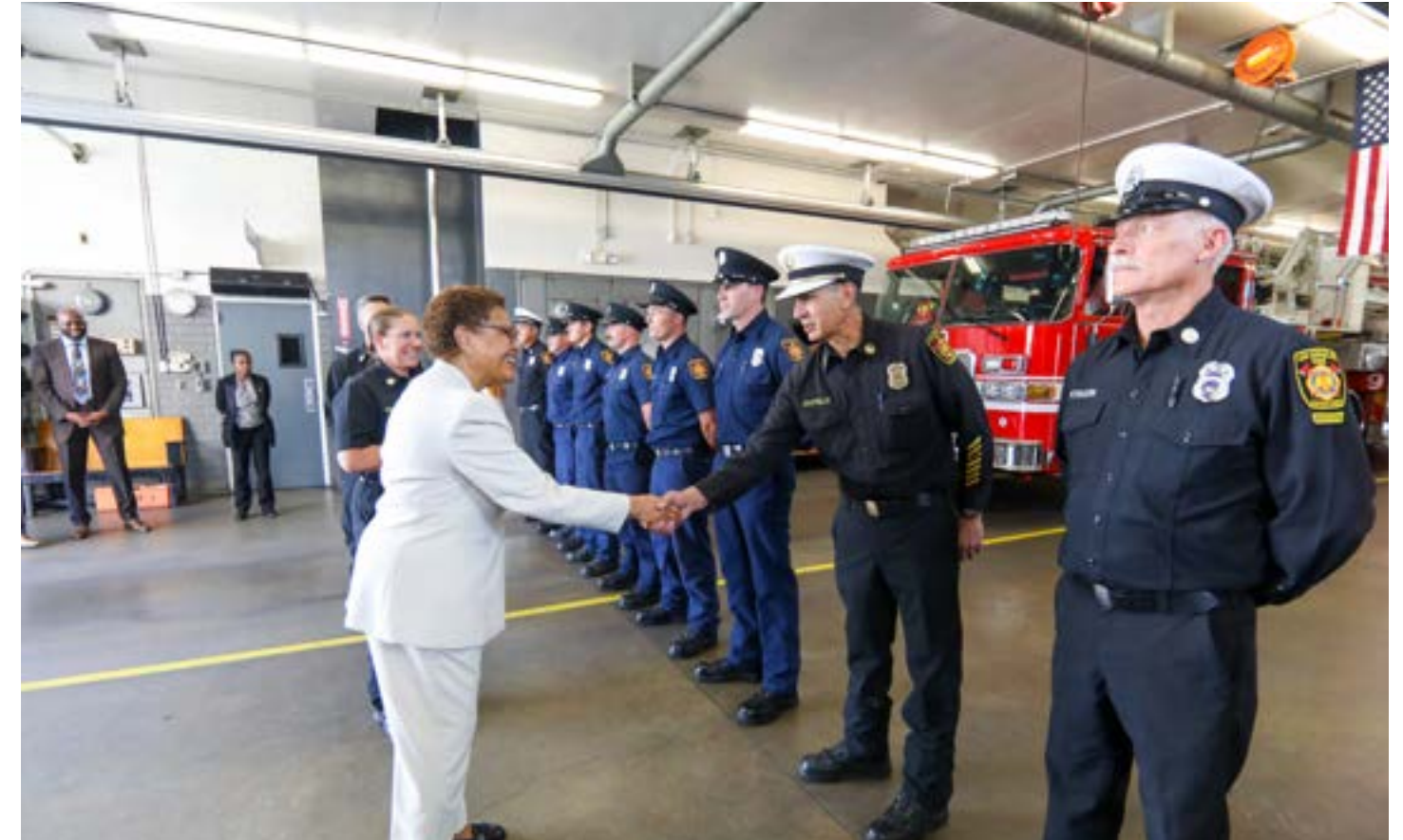
Mayor Karen Bass with LAFD Chief Kristin Crowley visiting Fire Station 9

The Los Angeles Police Department formed a regional Retail Theft Task Force in August. The Mayor helped secure $15.7 million from the state to support the Los Angeles Police Department's efforts to combat organized retail crime, which has now dropped 57% since the establishment of the task force and resulted in 196 arrests further disarming large, organized groups. The Task Force will continue its work to address this issue.