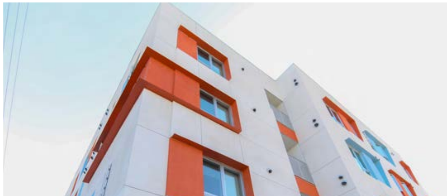
The grand opening of The Wilcox, a permanent supportive housing project expedited by Executive Directive 1

Following the Mayor's lead, the LADWP Board of Water and Power Commissioners directed the department to accelerate the approval process for 100% affordable housing developments. There are now 242 projects in the expedited construction and design process; 42 projects with 2,404 units have benefitted from expedited approvals; and 61 projects have benefitted from LADWP covering the costs of public right of way power. This program has saved $22.8 million for these projects and has cut the development review, engineering and construction timeline for affordable housing by 85%. Angelenos are moving into projects all across Los Angeles, like the Wilcox in Hollywood, months earlier than anticipated because of the Mayor's action.