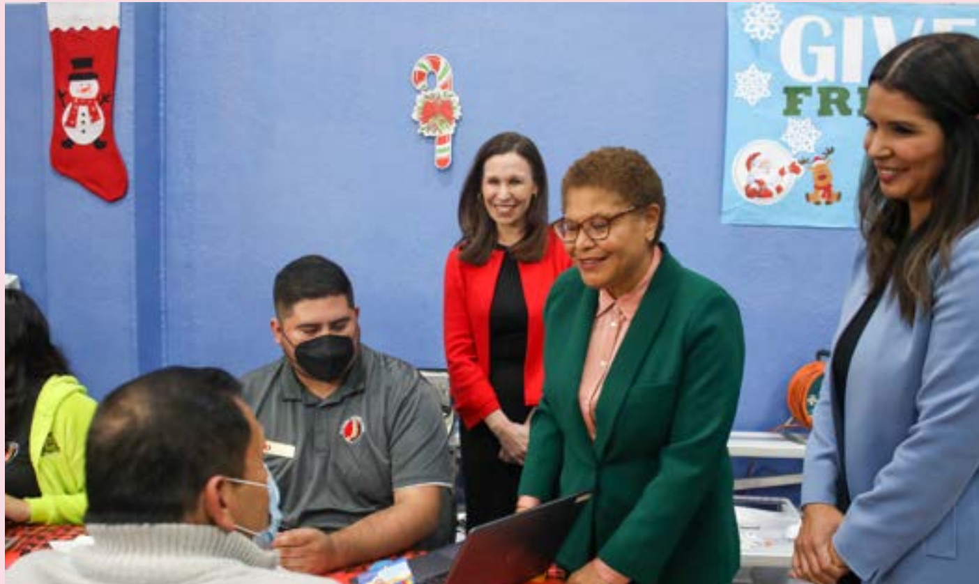
Mayor Karen Bass with staff and clients at the All Peoples Community Center launching the GIVEN direct cash assistance program to families in need.

Mayor Bass allocated additional funds in this year's budget to expand Family Source Centers, LA's Best after-school programs, and made new investments in child care facilities. Expanded services focused on the highest need in South Los Angeles, Panorama City, North Hollywood, Koreatown, and Central City.