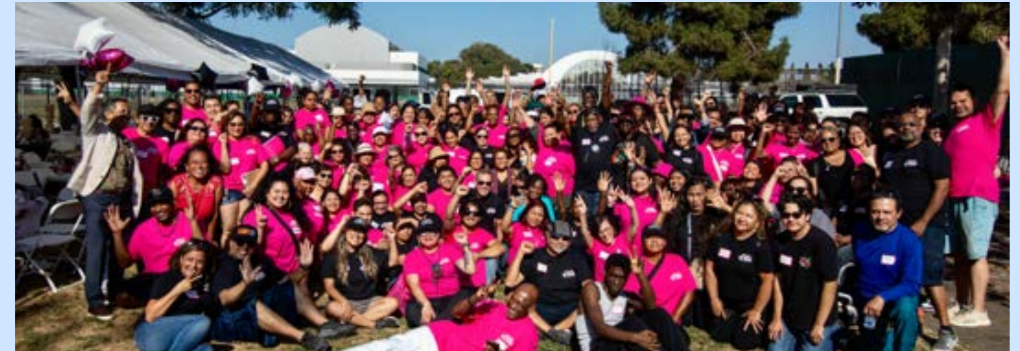
Mayor Karen Bass with We Are LA outreach workers. We Are LA reaches out to vulnerable Angelenos to directly connect them to a full range of homelessness prevention services.

The Mayor’s Fund Los Angeles is a separate nonprofit organization dedicated to serving LA. In partnership with Mayor Bass, it has anchored its work with a major initiative to prevent Angelenos from falling into homelessness.