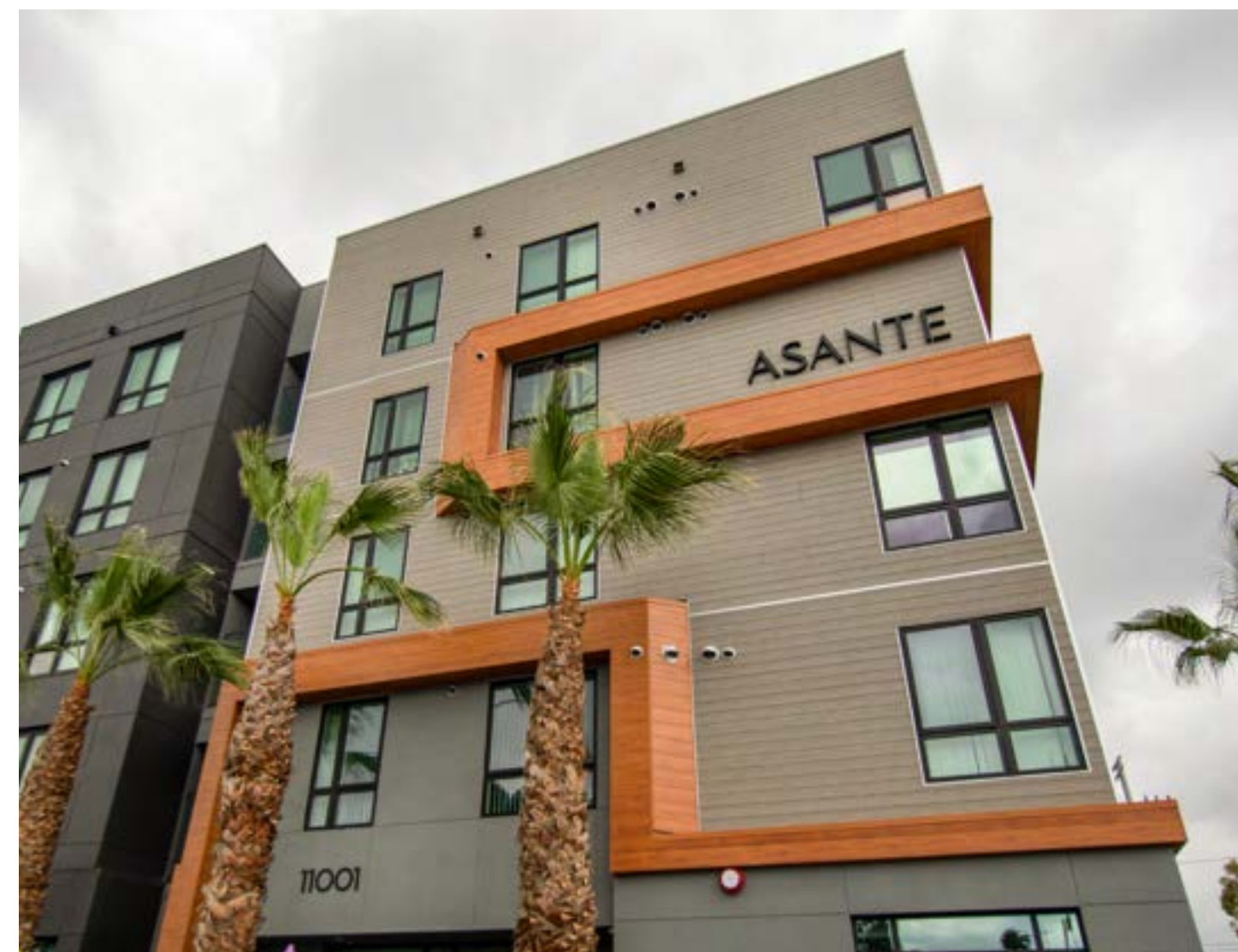
The grand opening of Asante Apartments, a permanent supportive housing project expedited by Executive Directive 1

Continuing her momentum to accelerate housing production, Mayor Bass signed Executive Directive 7 to make housing more affordable and available throughout Los Angeles. The executive directive works to incentivize more housing to be built faster, with an emphasis on affordable housing and mixed income housing, as well as homeownership, to help people at all income levels get housed. It will also help convert existing non-residential buildings into housing.