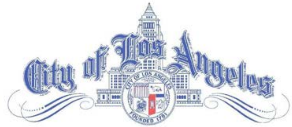
KAREN BASS MAYOR